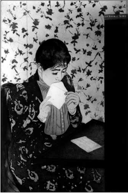
Mary Cassatt (1844–1926), The Letter , (detail) 1890–1891 Color drypoint and aquatint on laid paper, 17-3/16 x 11-15/16 in., National Gallery of Art, Washington Chester Dale Collection 1963.10.251